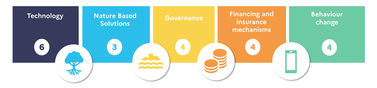
Figure: Actionable adaptive solutions in TransformAr

Insurance, financial and economic scheme solutions: University of Antwerp