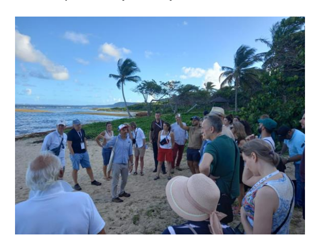
Plage de l'Anse Maurice

The third and fourth full days of the meeting allowed partners to go into detail on the work done, such as the data framework (CMCC), learning stories and lessons learnt management (ADEME), the stakeholder advisory board (FEUGA) and pathways (Acterra, Verhaert). We also discussed our contribution to international events (ADEME), our communication and dissemination strategy (WE/EQY), the plan for upcoming deliverables (UA), project management on ClickUp (UA), the plan for a common monitoring system (ADEME) and public acceptance (CMCC).