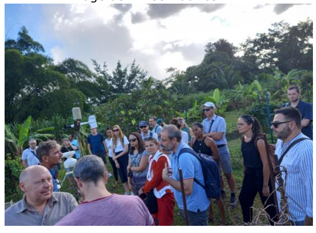
KaruSmart ecological micro-farm